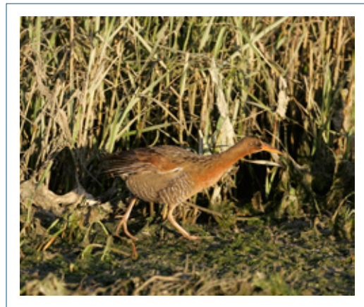
Clapper rails are an endangered bird species dependent on healthy coastal ecosystems.

Local human populations benefit from this restoration as well. Many of the neighborhoods nearest the South Bay project are home to disproportionately high percentages of residents who are people of color or live below the poverty line. 58 Restoring the salt ponds, and the San Francisco Bay in general, may reduce these socially vulnerable populations' exposure to environmental hazards such as flooding and sea-level rise, while also increasing their access to environmental services such as fishing and recreation.