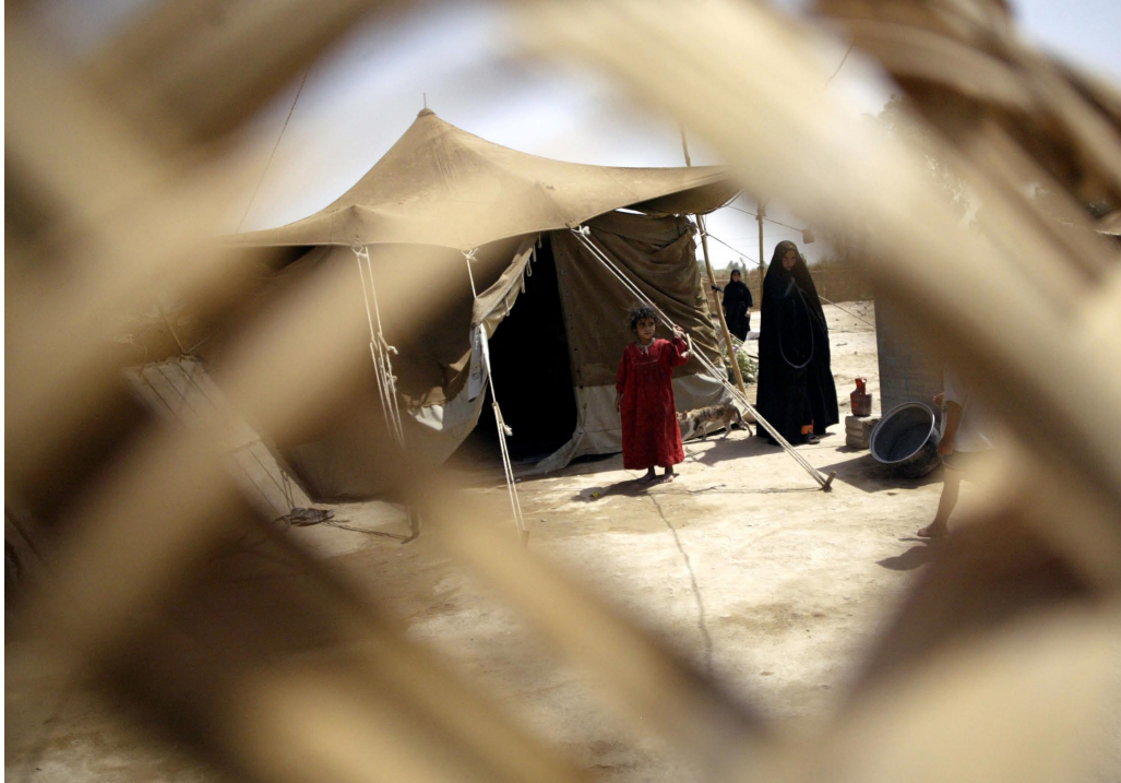
An Iraqi family is seen near their tent at the refugee camp they have called home for the last year in the Shiite holy city of Najaf in July 2007. Shiite families driven out of their homes by sectarian violence are resettling in Najaf.

ment and international organizations provide livelihoods. “One of the reasons that people are joining insurgent groups is because they’re getting paid for it,” she said. “They’re saying, ‘I’m not joining for ideological reasons, but I cannot feed my family any other way and here people are offering money and cash.’”