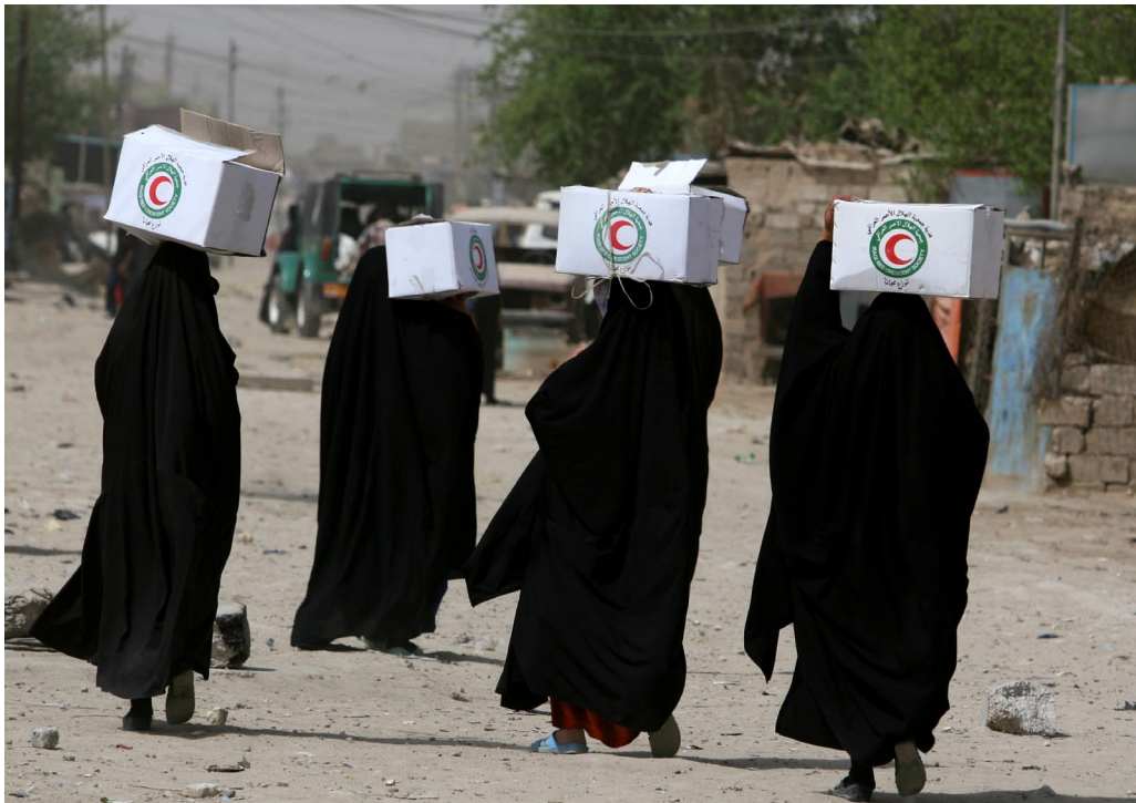
Iraqi women carry humanitarian aid packages distributed by the Iraqi Red Crescent Society in eastern Baghdad.

This plan would also include the construction of schools and water treatment plants via local materials and labor and would aim to give every family a home with running water and electricity, a functioning local school providing K-6 education, job training for adults, and access to