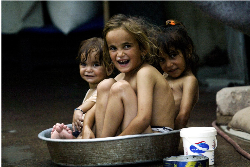
Sisters bathe at a camp for Shiites who have fled sectarian violence near the holy city of Najaf in July 2007. About 8 million Iraqis, nearly a third of the population, are in urgent need of water, sanitation, food and shelter.

healthcare. The one-year goal would be to normalize 600,000 internally displaced persons, or IDPs, currently based in Baghdad at the cost of about $500 million. This goal requires the help of the local populations, the Iraqi government, regional neighbors, the Gulf States, the U. S. government, the United Nations, all the NGOs, and individuals who can make donations, said Hakki.