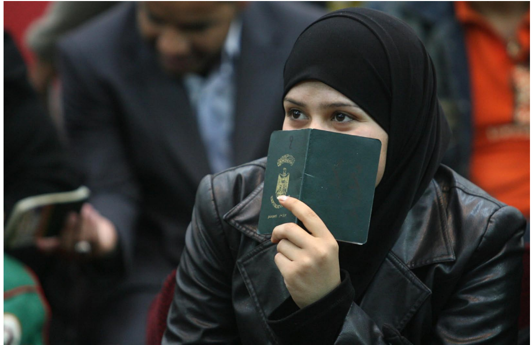
An Iraqi refugee who has just returned from Syria covers her face with her passport as she waits to collect government aid in Baghdad in November 2007. About 20 buses carrying hundreds of Iraqi refugees returned to Baghdad from Syria.

emergency medical care. This parole program is temporary, however, he added. He noted that it can succor to a limited number of people, lacks funding, does not convey immigration status, and is entirely voluntary.