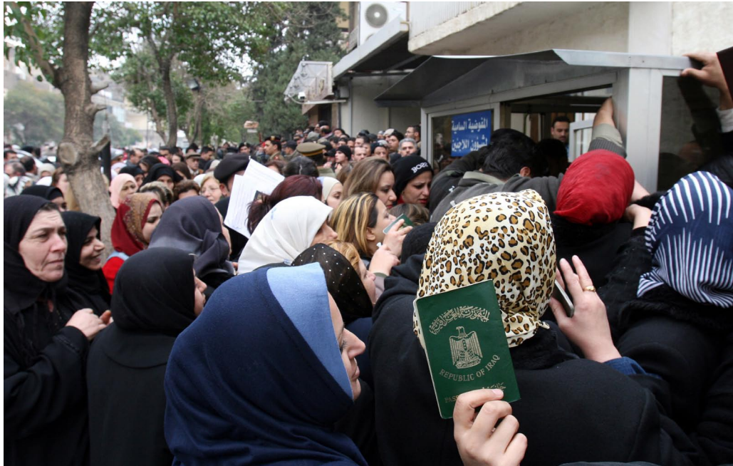
Thousands of Iraqi refugees gather outside the offices of a U.N. refugee agency in Syria's capital city Damascus in February 2007 to register their names for obtaining a refugee status. Some refugees also demanded that the Syrian government revoke restrictions on their residency in Syria.