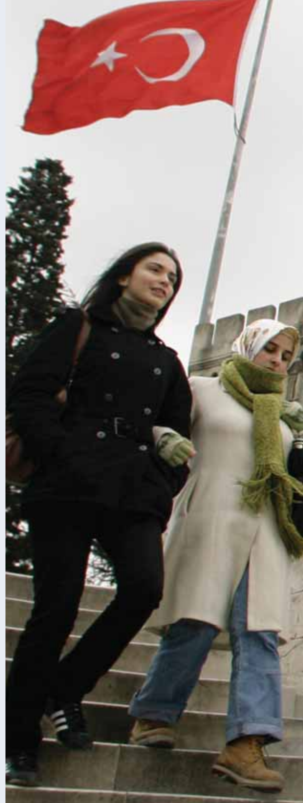
Turkish university students, one of them wearing a head scarf, walk by the main campus of the Istanbul University, in February 2008.

As in many countries around the world, worries about the economy are increasingly dominating internal debates in Turkey. This does not mean that the sensitive questions linked to Turkish identity are erased by these economic difficulties. But in the coming months and perhaps years, core economic issues will require more attention from the Turkish government.