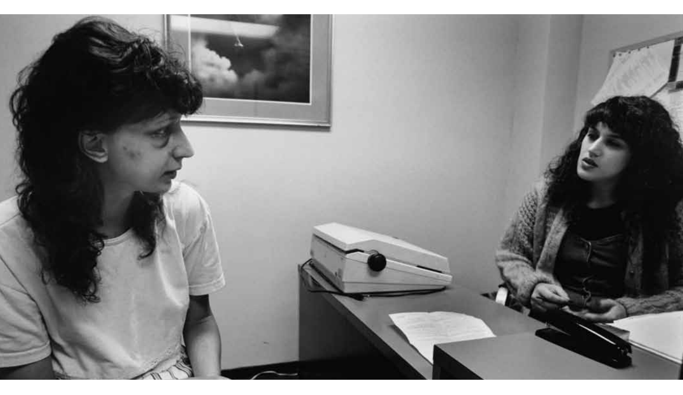
SEEN BUT UNSEEN. Domestic violence has many unacknowledged effects on the workplace.

Just about all of these hazards plagued women at Eveleth Mines in Minnesota. For its first 10 years of operation, the iron-ore mining and processing company employed only men in its hourly workforce.<sup>63</sup> In the 1980s, women began to get jobs formerly reserved for men but made up less than 5 percent of the hourly employees. No woman had ever been promoted to foreman. Women workers earned much less than men because they were confined to the lower job classifications and worked fewer overtime hours.