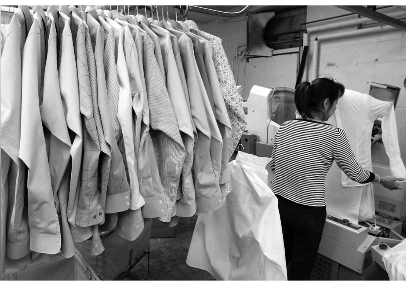
DANGER AT THE DRY CLEANERS. Repetitive tasks amid hot and hazy working conditions make this a risky job.

Even though we think of the kinds of jobs that men tend to hold—such as construction worker, machinist, or firefighter—as more dangerous or onerous than the jobs that women tend to hold, this isn't necessarily the case. Those women most at risk are typically the least informed about dangers and solutions and have the least resources to challenge hazards on the job. The underreporting of women's injuries and health problems creates the false impression that women are in "safer" industries and that only male-dominated occupations such as construction, mining, and environmental cleanup involve high-risk work.