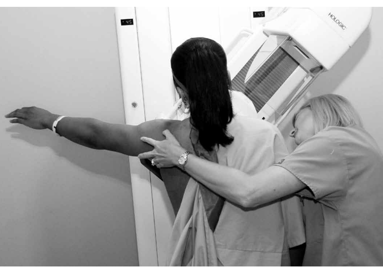
HEALTH CARE HAZARDS. Exposure to x-rays and other medical risks in hospitals affict nurses in this female-dominated industry.

Although inadequately studied, their disproportionate exposure to workplace hazards plays a major role in the many health disparities experienced by women of color, who suffer higher death rates from childbirth, hypertension, diabetes, cancer, and other illnesses.<sup>55</sup>