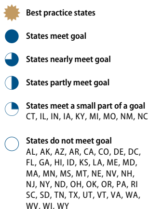
FIGURE 1 How states are faring on tenure