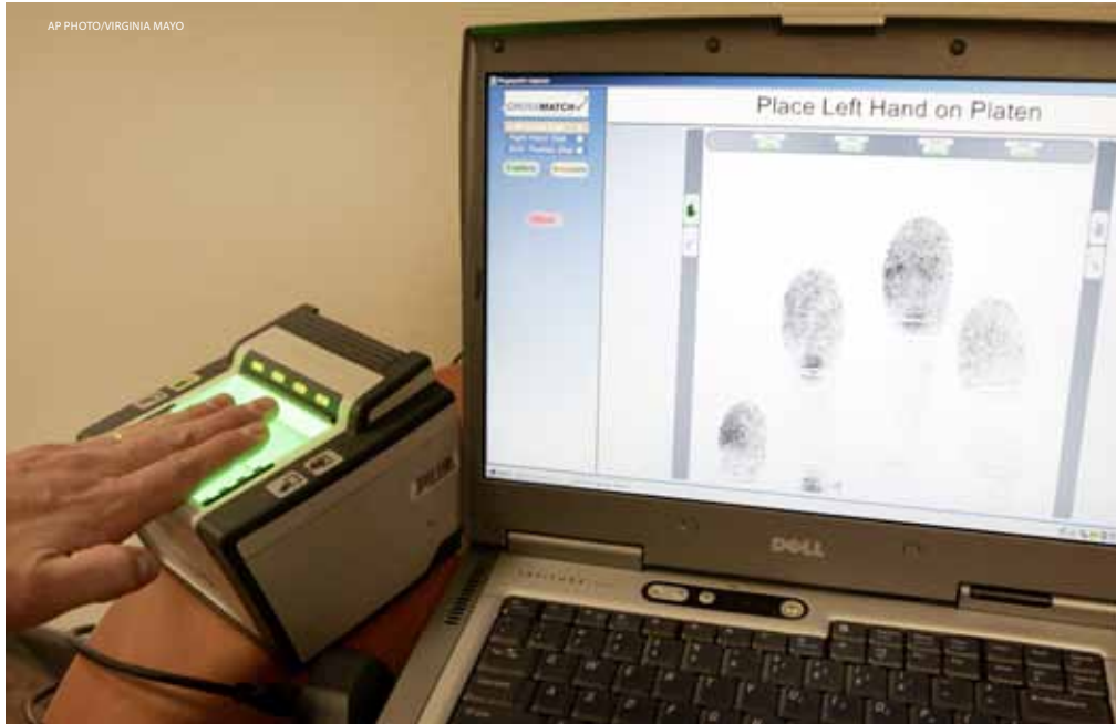
A man demonstrates the new 10-fingerprint scanner and its output on the computer.

metrics, and the State Department identifying thousands who are ineligible to receive visas to travel to the United States. 29 There is little doubt that the program has deterred countless more. Further, it has helped not only consular and CBP officers adjudicate visa and entry applications, but with the addition of USCIS data in the DHS Automated Biometric Identification System, or IDENT, USCIS benefit adjudicators can now identify immigration benefit fraud through the use of biometrics.