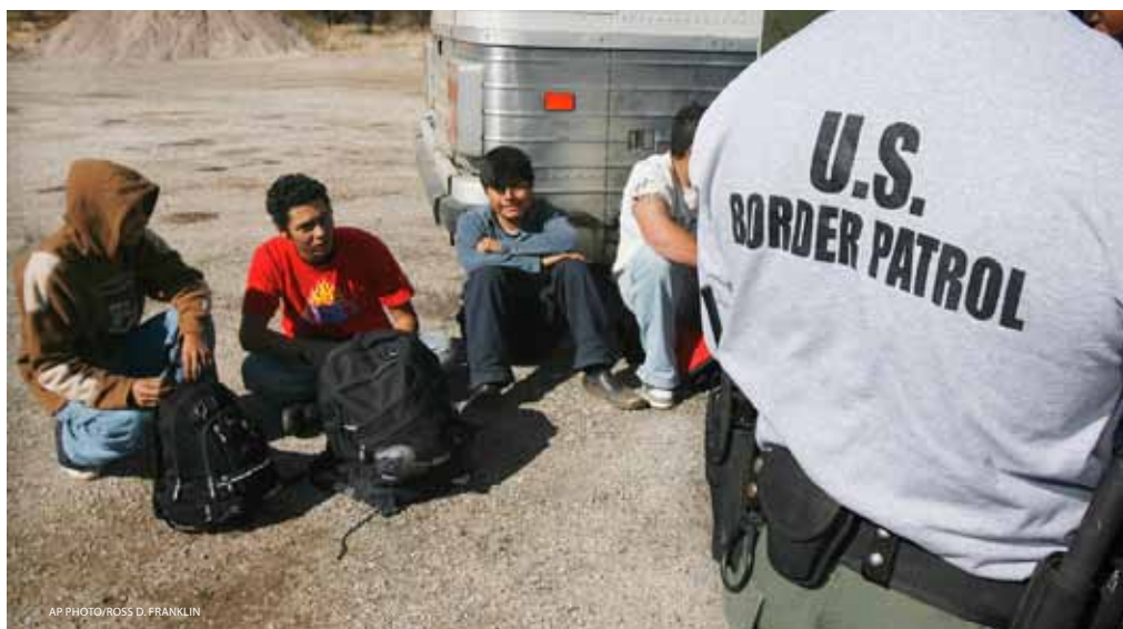
A U.S. Border Patrol agent processes a number of suspected illegal immigrants caught entering the United States.

Since CBP's creation in 2003, the agency has worked hard to gain effective control of the 1,950-mile U.S.-Mexico border by deploying a mix of resources and enforcement operations supported by intelligence activities.