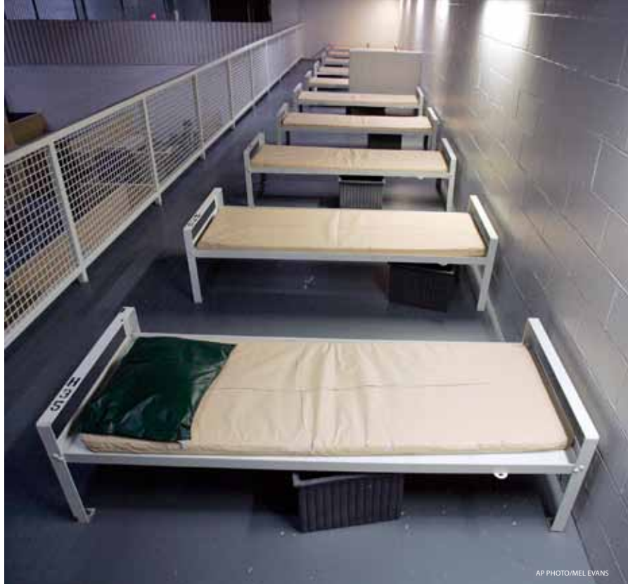
A row of beds at the Elizabeth Detention Facility, a Corrections Corporation of America immigration facility in Elizabeth, New Jersey.

without a hearing before an immigration judge. This new policy applied to those immigrants apprehended within 100 miles of the Mexican or Canadian borders within their first 14 days in the United States. The expansion of expedited removal has been somewhat controversial in some quarters due to concerns about whether individuals receive fair consideration of their situations. But it demonstrates the heightened level of seriousness and commitment to enforcement that has taken root over the last several years.