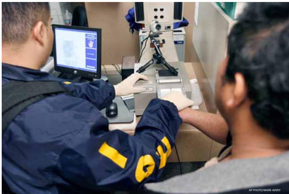
Suspects are photographed and fingerprinted by an Immigration and Customs Enforcement officer.

For many years, immigration enforcement officers have been able to access an immigrant's criminal history information after fingerprinting them. Law enforcement officers, however, have not had the ability to simultaneously receive both the immigration status of an individual as well as the person's criminal history