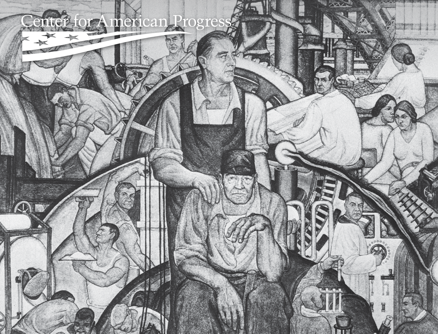
This January 1935 photo shows a mural depicting phases of the New Deal