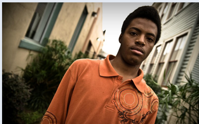
JUVENILE JUSTICE PROJECT OF LOUISIANA, 2010

His story is all too familiar for gay and transgender youth in this country. Unsafe schools and unfair criminalization of gay and transgender students can perpetuate a vicious cycle where gay and transgender youth, especially those of color, are pushed through the juvenile justice