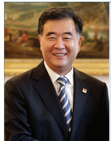
Bo Xilai Current Chongqing Party Secretary, Potential Politburo Standing Committee Member