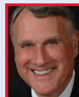
Jon Kyl (R) NO

On May 8, the U.S. Senate considered a motion to bring forward legislation designed to keep interest rates from doubling on July 1. Despite statements of support from both parties, the motion failed—on a party line vote of 52 to 45—to reach the 60 vote threshold needed to bring the bill to the floor.