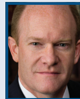
Christopher Coons (D) YES