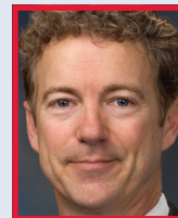
Rand Paul (R) NO