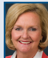
Claire McCaskill (D) YES