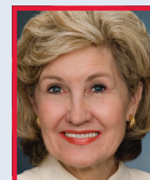
Kay Bailey Hutchison (R) NO