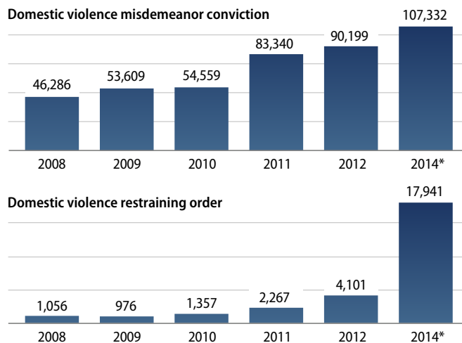
FIGURE 3 Prohibiting domestic violence records in the NICS Index

If all states submitted records of misdemeanor domestic violence convictions at the average rate of these three states, we can project that there would be 2.9 million records in the NICS Index in this category, more than 40 times the number currently submitted. In other words, the current total of domestic abuser records in the FBI NICS Index likely makes up 5 percent or fewer of the total number of