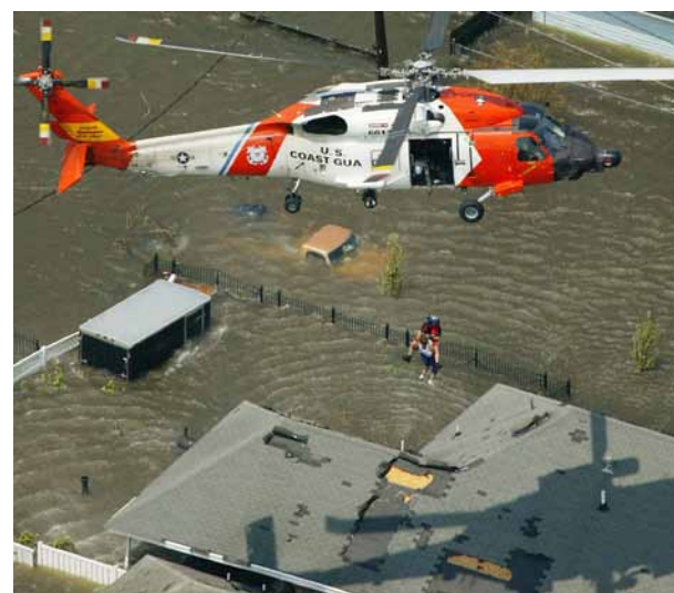
A resident is rescued by the U.S. Coast Guard from a home surrounded by floodwaters from Hurricane Katrina Tuesday, Aug. 30, 2005 in New Orleans.

While hurricanes on the scale of Katrina have been rare in the United States, USCG will continue to serve as a first responder to severe coastal disasters. Indeed, for Hurricane Katrina, then-Coast Guard Commandant Thad Allen was