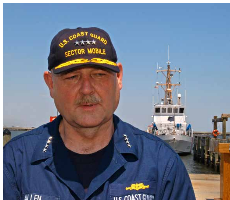
Coast Guard Adm. Thad Allen, 2006.

It was an ambitious plan for a service that had seen the scope of its responsibilities increase considerably since 2001. Lessons learned in the Coast Guard's response to September 11 and Hurricane Katrina gave new impetus to the modernization plan. These operations "highlighted the need for enhanced standardization across the service and more centralized logistics and asset management," 57 another centerpiece of the modernization program. Ultimately, the service saw the program as a means to enhance overall Coast Guard performance, improve coordination, and continue its tradition of adaptability in order to carry out its traditional and homeland security duties.