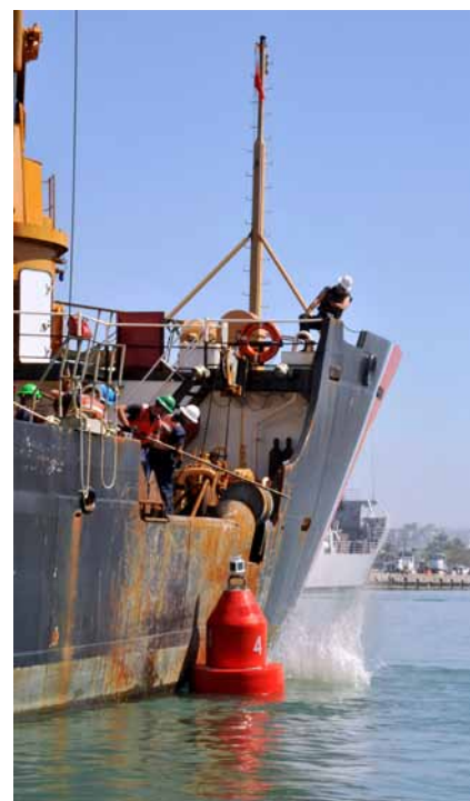
In this Thursday, Jan. 21, 2010, photo provided by the U.S. Coast Guard, the buoy chain is shown splashing into the water as the crew members aboard the U.S. Coast Guard Cutter Oak set the second buoy in Port-Au-Prince, Haiti. The buoy was set to mark safe water as ships approach the APN Main Terminal pier.

In the weeks following the USCG initial response to Haiti, former Coast Guard Commandant Adm. Thad Allen stated in his final State of the Coast Guard address that the age and condition of the Coast Guard's fleet is "putting our crews at risk, jeopardizing the ability to do our job." This address, perhaps the former commandant's most ominous statement to date, served to underscore the deteriorating condition of the Coast Guard's aging fleet.