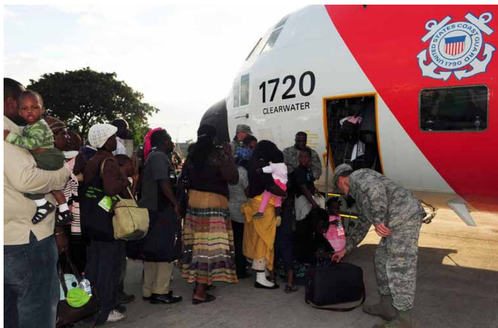
In this Jan. 16, 2010 photo released by the U.S. Coast Guard, earthquake refugees stand in line to board a Coast Guard aircraft in Port-au-Prince, Haiti before heading to Homestead, Fla., after an earthquake struck Haiti on Jan. 12. Around 60 people boarded the aircraft, including children and the elderly.

The Coast Guard was a critical player in the United States' successful relief effort in Haiti, but the service also experienced serious equipment and logistical challenges as a result of the age and condition of its equipment. Twelve of the 19 cutters that were eventually sent to Haiti required emergency maintenance while two of them had to be recalled from operations for emergency dry-dock repairs. Coast Guard helicopters that